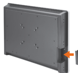
▲ CompactFlash™ slot with protective cover