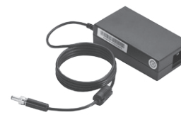
▲ AC power adapter (GOT5152T-832-J)